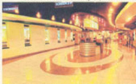
Movie-watching experience in the city is now truly world-class

Location: Prasad's Multiplex